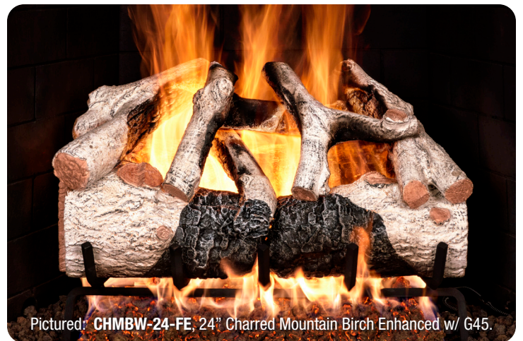
Pictured: CHMBW-24-FE , 24" Charred Mountain Birch Enhanced w/ G45.