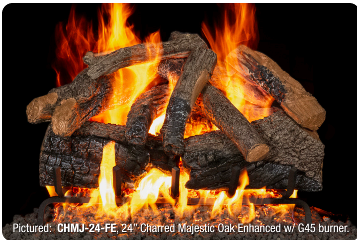
Pictured: CHMJ-24-FE , 24" Charred Majestic Oak Enhanced w/ G45 burner.

Headlining the Real Fyre Premier Series gas log sets, the new Charred Cinder Collection offers a dramatic fire presentation highlighting exposed embers, décor chunks and unique burnt detailing complemented with black embers. The model CNDO oak version leads the way with birch (CNDB) and split oak (CNDS) units following later this Spring. Available in three sizes (18,24,30), the Charred Cinder models are compatible with G4, G45 and G46 burners in natural gas and propane versions.