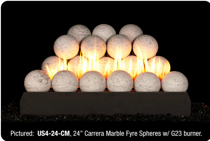
Pictured: US4-24-CM , 24" Carrera Marble Fyre Spheres w/ G23 burner.