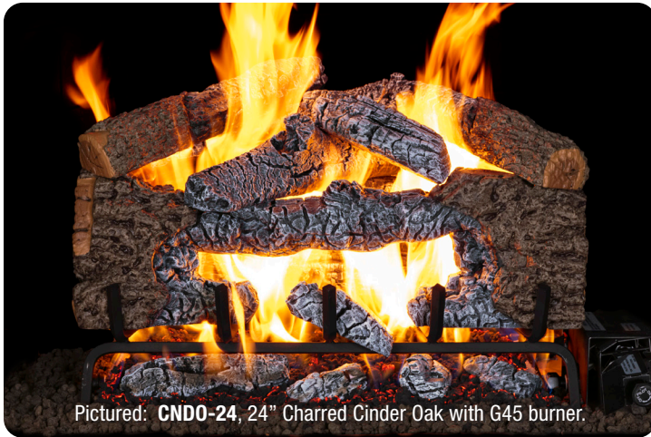
Pictured: CNDO-24 , 24" Charred Cinder Oak with G45 burner.