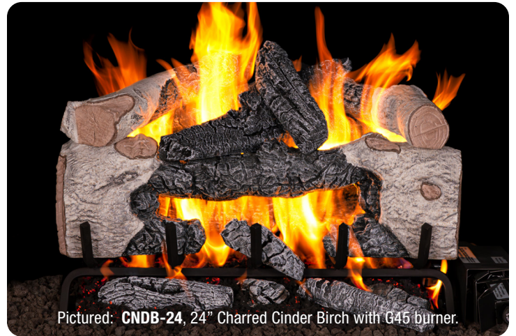
Pictured: CNDB-24 , 24" Charred Cinder Birch with G45 burner.