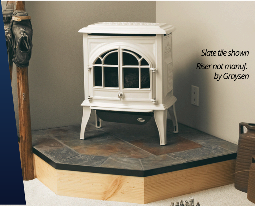
Slate tile shown Riser not manuf. by Graysen